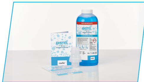
1 LITRE DISTEL DOSING SYSTEM CCH050201

1 x 1 Litre Bottle of Concentrate - 5 x 1 Litre Dosing Bottles 6 x 5ml Dosing Heads - 1 x Working Solution Bottle Label