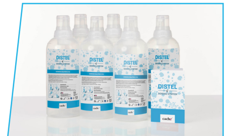
1 LITRE DISTEL DOSING SYSTEM DOSING BOTTLES CCH050301

1 x 1 Litre Bottle of Concentrate - 1 x 5ml Dosing Head 1 x Working Solution Bottle Label