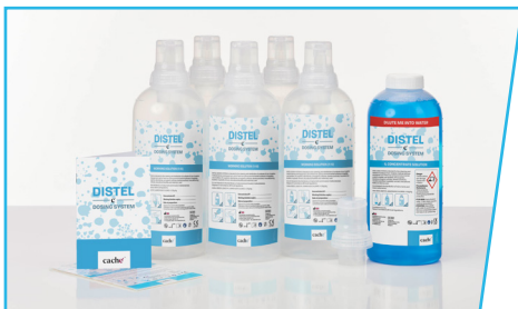
1 LITRE DISTEL DOSING SYSTEM STARTER PACK CCH050101

1 x 1 Litre Bottle of Concentrate - 5 x 1 Litre Dosing Bottles 6 x 5ml Dosing Heads - 1 x Working Solution Bottle Label