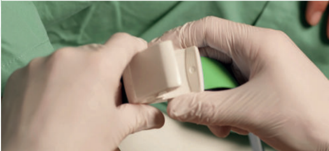
1. application Loop daisygrip around the patient's limb, click magnetic clasp together.