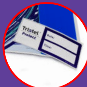
72-HOUR TRACKING LABEL