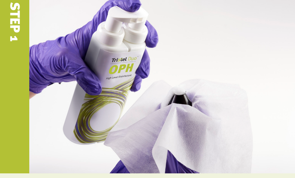
Dispense two aliquots of Tristel Duo onto a dry wipe (Duo Wipes are recommended) or directly onto the lens.