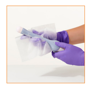
the device until soil and organic matter have been visibly removed. In case of heavy soiling repeat the process.