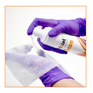
Tristel Clean onto a dry wipe.

Tristel Duo ULT is chlorine dioxide in a foam, designed specifically for the high-level disinfection of endocavity and skin surface ultrasound probes. Tristel Duo offers speed, safety, efficacy and excellent material compatibility.