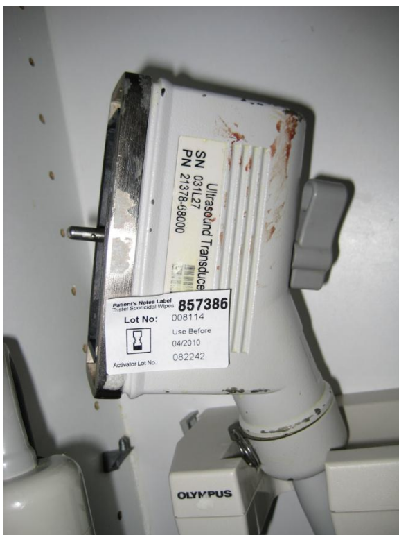
Figure 2. Any part of the TOE probe can be a source of contamination.

All TOE probes, irrespective of the manufacturer, share the same components (see Glossary and Figure 1): a flexible tip, a shaft, a probe handle with steering controls and a cable which attaches to the plug socket in its associated equipment ( Figure 1 ). Handling of any part of this apparatus results in a potential source of infection ( Figure 2 – these were probes considered to have been decontaminated by a manual wipe system and were ready for re-use with a subsequent patient). During passage into a patient, there is contact with intact mucous membranes and the potential for contact with non-intact mucous membranes. This means that TOE probes require disinfection to a similar level as upper GIE 3 .