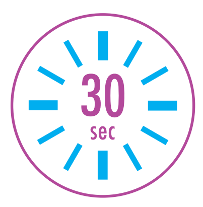
LEAVE THE SURFACE TO DRY TO ENSURE A MINIMUM CONTACT TIME OF 30 SECONDS.