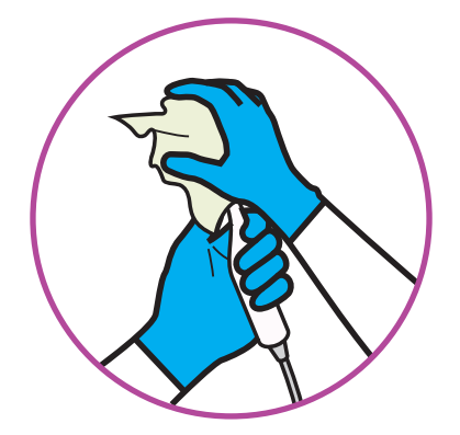
USE THE WIPE TO SPREAD THE FOAM OVER THE SURFACE OF THE ULTRASOUND PROBE AND ASSOCIATED PARTS. ENSURE ALL AREAS ARE COVERED.